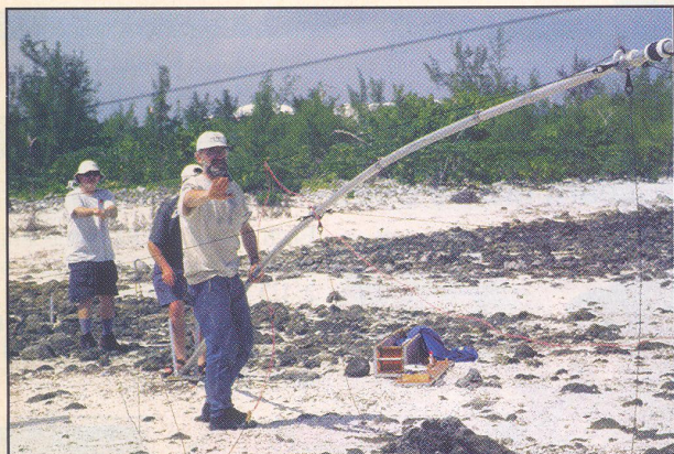
Up goes the Battle Creek Special. This antenna was the expedition's low-band workhorse.