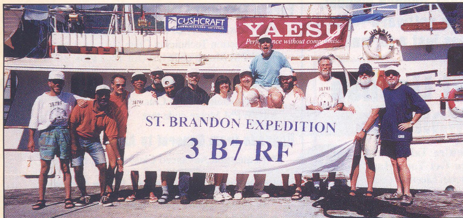
The 3B7RF crew arrives back in Mauritius after a successful DXpedition.