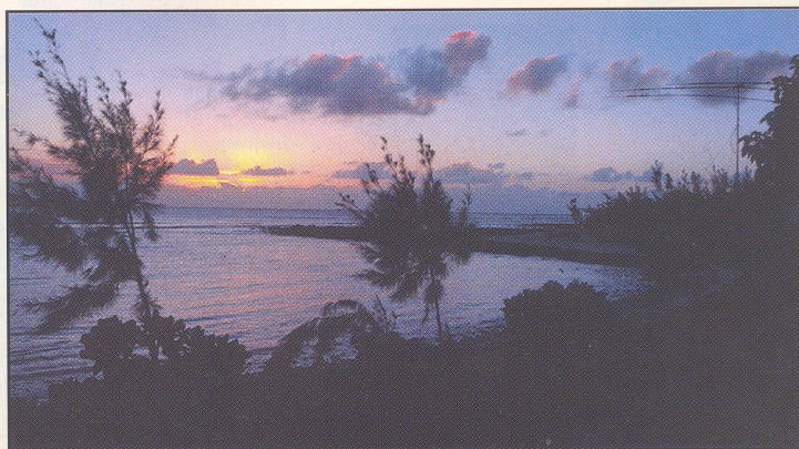
DXpeditions are not strictly about hamming. There's always time to take in a spectacular island sunset.